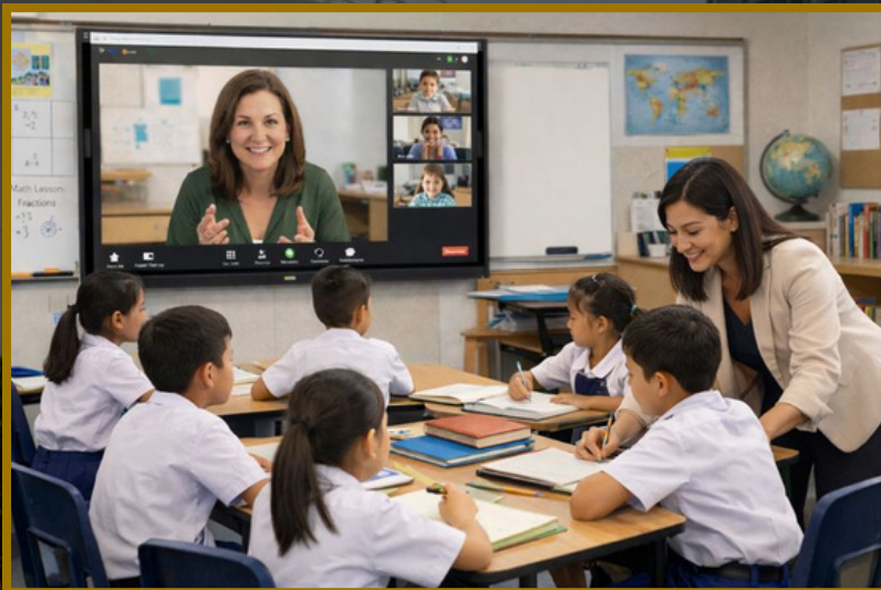
Model 1 - Hybrid Learning

This approach allows schools to raise academic standards, broaden subject provision, and offer premium teaching expertise without the significant cost and recruitment challenges typically associated with specialist staff.