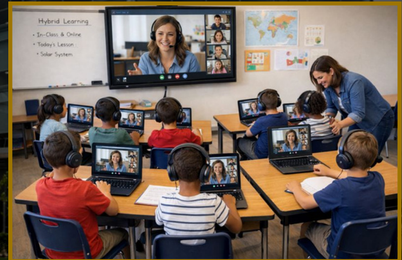
Model 2 - Enhanced Hybrid Learning